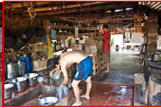
Plate 6: Preparation Activity in Awkward Squatting Posture