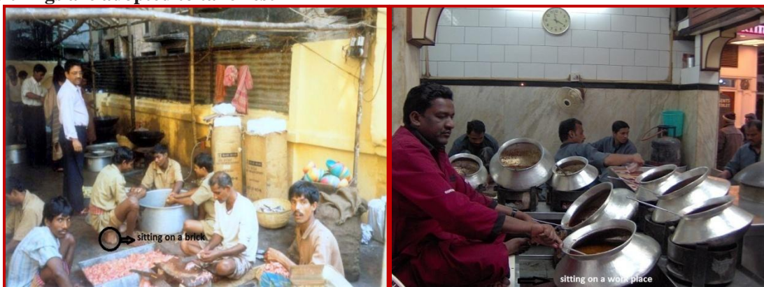
Plate 3: Worker Sitting on a Brick