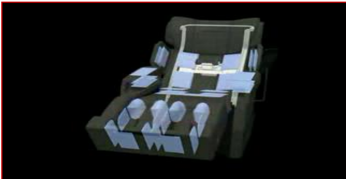
Plate 2: Front view of Relaxing Chair in Solid Work