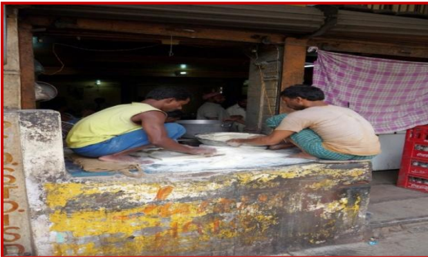
Plate 5: Dish Washing Activity in Awkward Bending Posture